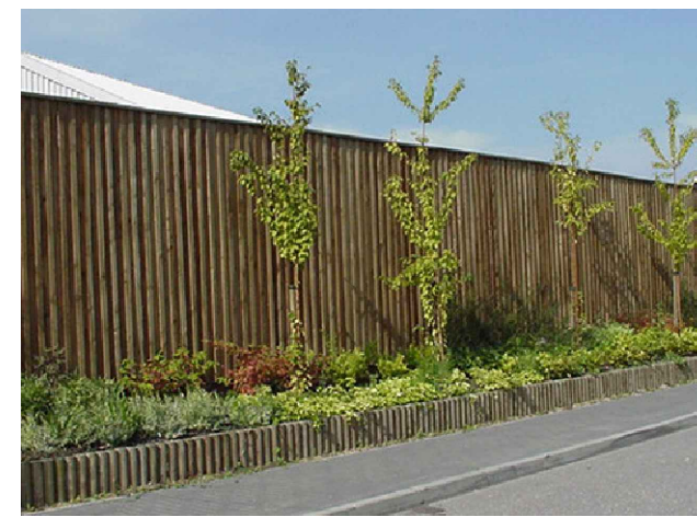
TYPICAL CLOSED BOARD FENCE IMAGE